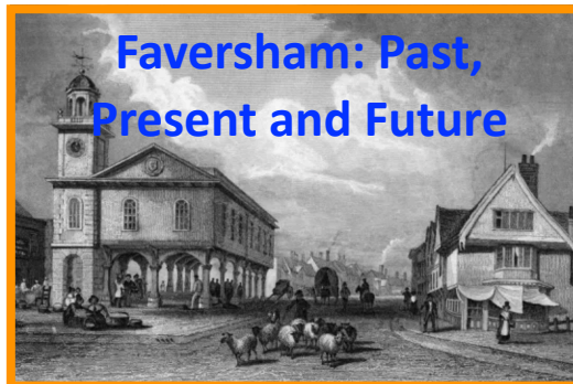
Faversham: Past, Present and Future

Throughout Term 6, our English will link directly with our geography topic: Faversham - Past, Present and Future. The aim will be for our children to speak and write 'like geographers'. The children will also be rehearsing for our showcase assembly and our end-of-year production: Robin and the Sherwood Hoodies. All the children will be writing about their memories of their time at Ethelbert Road to read aloud in our leavers' assembly.